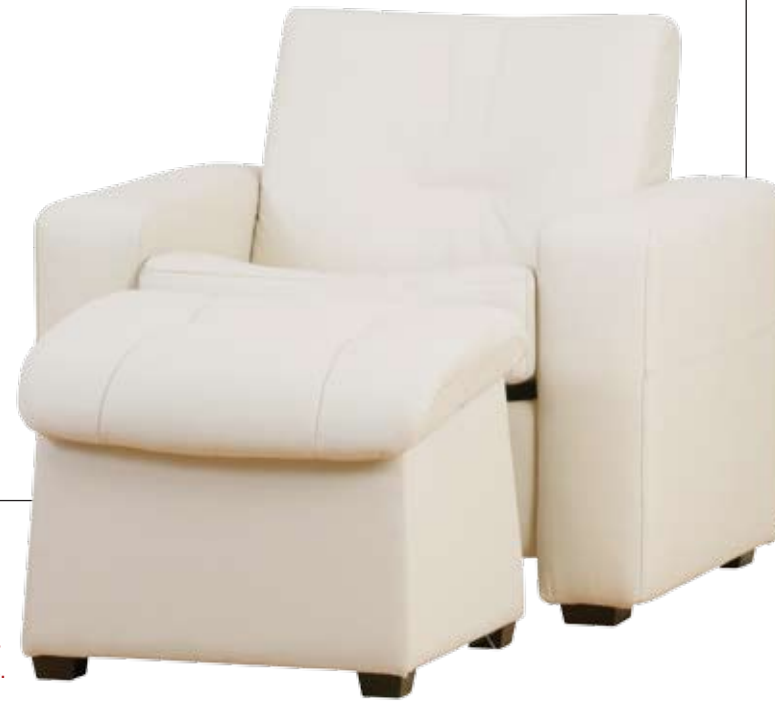
FS 340 1 SEAT WITH ARM B.