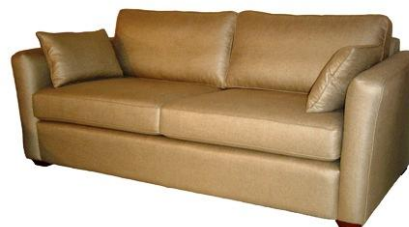
Newton 2100mmW x 1000D x 850 H Generous 2.5 seater

Family gatherings, parties, special occasions... all times when you can end up with more guests than you have beds.