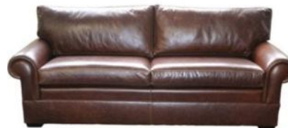
Charles 2370mm x 900D x 960 H Generous 2.5 seater