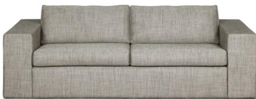
Metro 2170mm W x 960D x 670 H Generous 2.5 seater